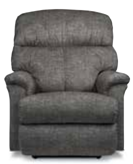
REED Rocking Recliner orig. $899