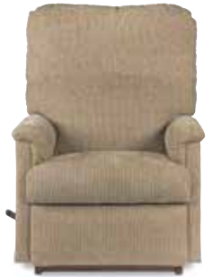
COLLAGE Rocking Recliner orig. $699