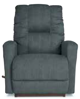
CASEY Rocking Recliner orig. $699