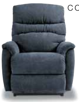
COLEMAN Rocking Recliner orig. $799