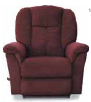
JASPER Rocking Recliner orig. $899