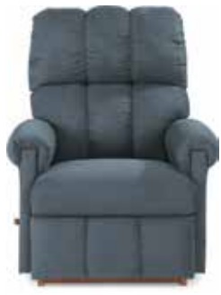
VAIL Rocking Recliner orig. $799